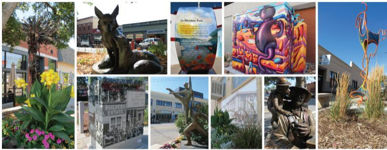
GUIDE TO DOWNTOWN DESIGN STANDARDS LOVELAND, COLORADO

- Loveland Creative District www.lovelandcreativedistrict.com